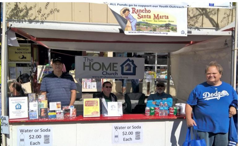
At the Campbell Oktoberfest, selling drinks & sharing the word