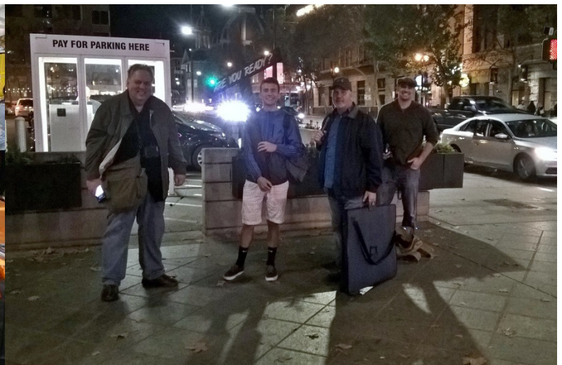
Good street preachers are rare. I'm blessed to know many!