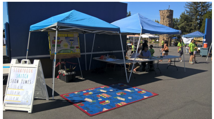
Sharing at the Milpitas Christian Race for Education festival