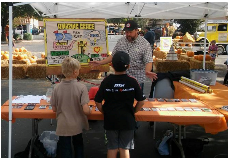
Sharing at the Home Church Harvest Festival