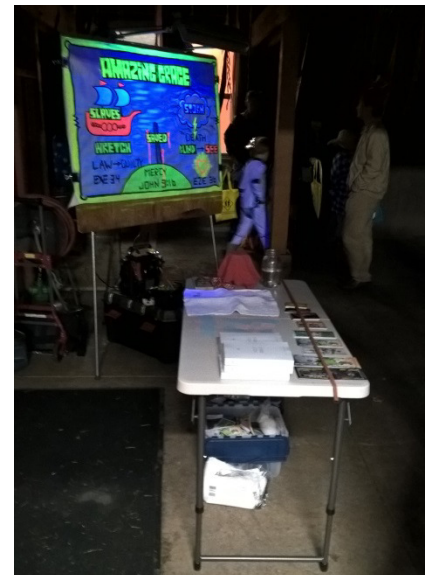
Set up at Crosswalk Church

Downtown San Jose Bar/Club District – This was our eighth year preaching to the Halloween weekend party goers, and though the traffic was lighter than previous years, there were still plenty of people. We had a good sized team, including several other good street preachers, and plenty of good conversations. I need to preach there more. I used to be there weekly, and I've missed it.