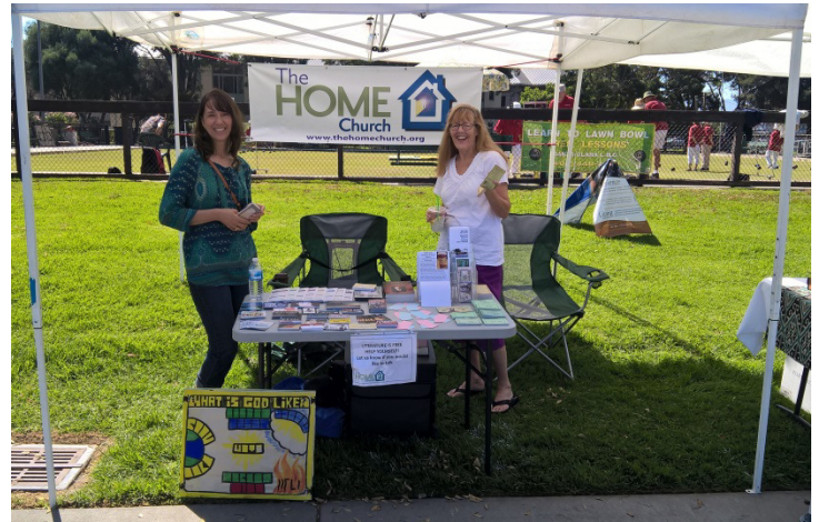
Our outreach booth at the Santa Clara Art and Wine Festival

Festivals and Fairs – I had some great ministry time at local fairs and festivals this last two months. Art and Wine festivals are great spots to share with people. They are there to relax, so they have the time to stop and talk. For many festivals, we also end up in the Free Speech section, which means a chance to talk to people at other booths, often from other faiths. At the Santa Clara Art and Wine Festival we were able to talk to several groups, and had a particularly good conversation two men sharing about Islam, and with a couple young agnostics who stopped to participate in that discussion. We also attended the Milpitas Christian School Race for Education . I presented two sketchboard messages, along with sharing many one-on-one object lessons. It was a very fruitful time. We also attended the Campbell Oktoberfest , and though the weather turned bad, we were still able to hand out a fair amount of Gospel tracts. Next year should be even better.