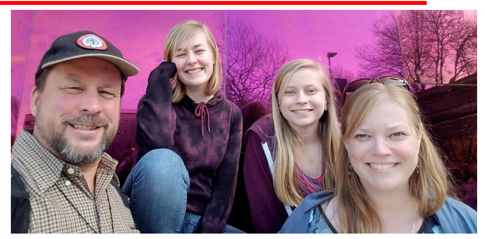
Outside the Museum of Pop Culture in Seattle

We just finished a week of family time in Washington State. We have not been able to visit my family there for almost 15 years. Some have visited us, but not all have been able to. I have a 3-yearold niece I had never even met. What a blessing it was to see everyone! We are also very thankful for the Christian families who hosted us for several of our