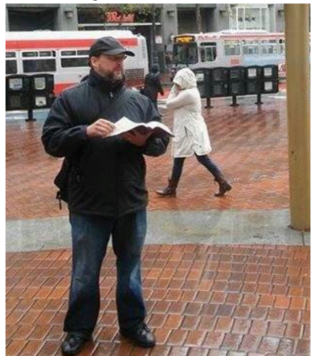
San Francisco, in the rain and in the sun.