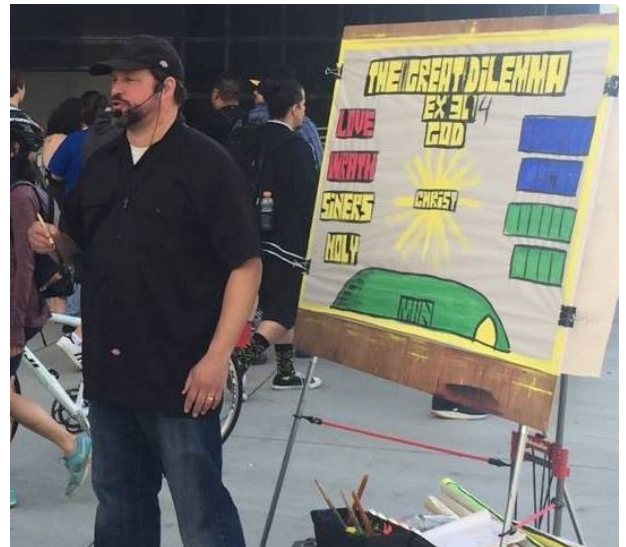
Preaching outside San Jose Comic Con

I love talking to students! Praying I can visit more college campuses