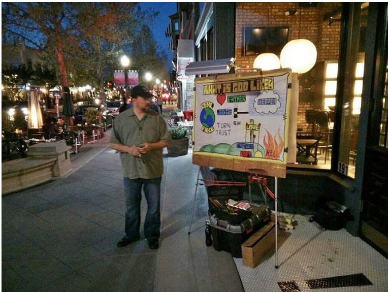
Preaching on Castro St. in Mountain View