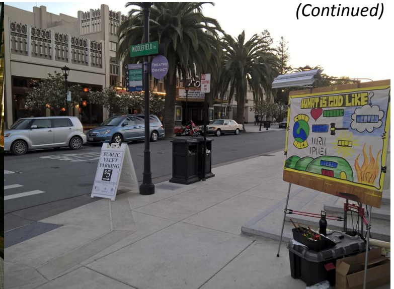
Set up and ready to start in the Redwood City Theater District