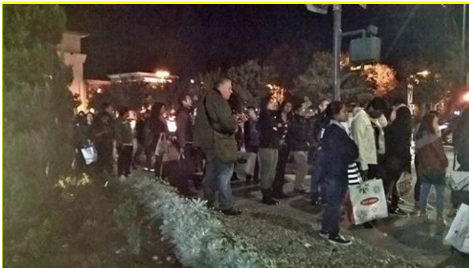
Tracting the crowds on Black Friday