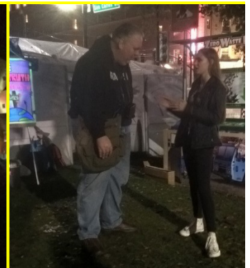
Talking with a new believer