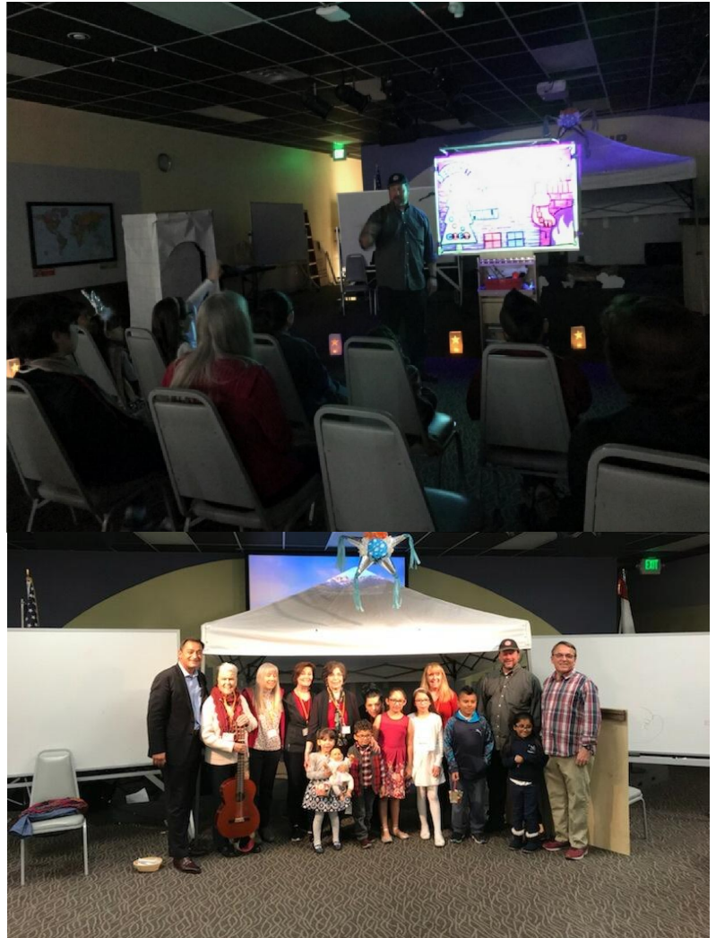
Teaching the final Bible lesson for Word Play at Home Church. The teaching team, and the kids, were a huge blessing.