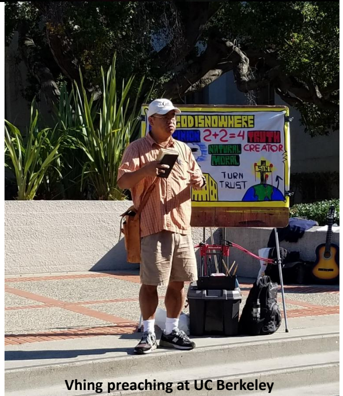
Vhing preaching at UC Berkeley