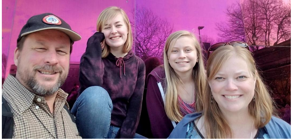
Outside the Museum of Pop Culture in Seattle